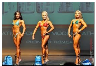
Figure a girl needs enough beautifully shaped muscles everywhere, and be lean enough for definition but not too much so she loses any femininity. In this class you can win or lose depending on your shoulders and glutes. To me Figure is sculpturing. You need different size muscles to sculpt the best symmetry and the work is never