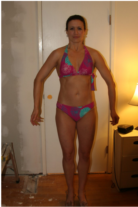
June 2014 (136 lbs)